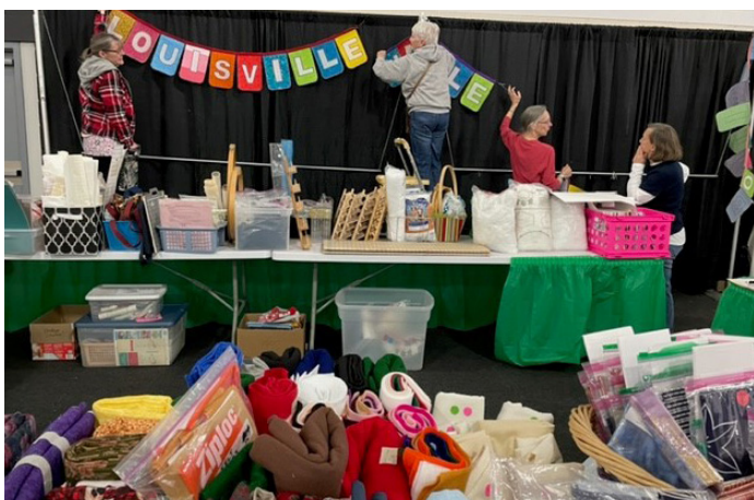
We worked hard and had FUN.

Next year, come and JOIN the FUN! In the next newsletter information will be shared on how to join the Boutique Team as we start working towards next year's boutique.