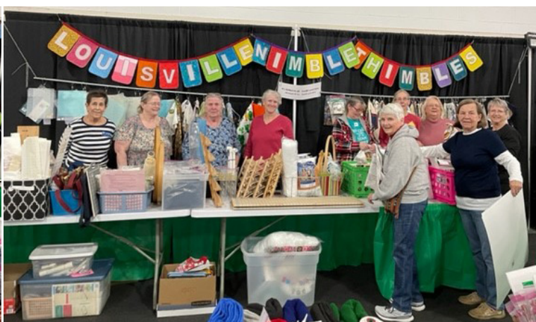
We were ready for more FUN.