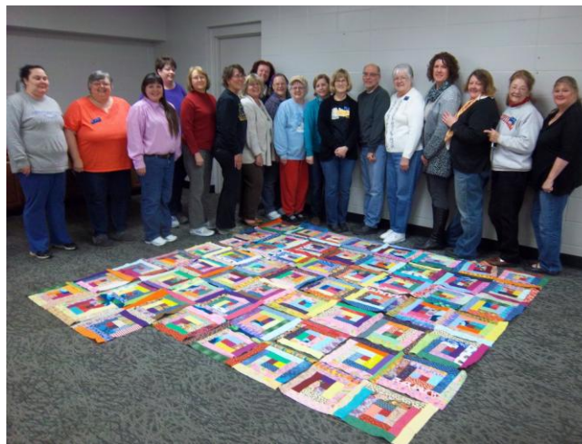
March evening meeting: Round Robin Log Cabin blocks for Cuddle Care quilts! What a blast!

Bold black and white stripes and a colorful appliquéd green gator. Inspired by the Alligator Madras Nursery collection by Pottery Barn Kids, this quilt will help brighten the day for a sick Kosair kid. Bring your brown bag lunch. Supply list to be made available soon.