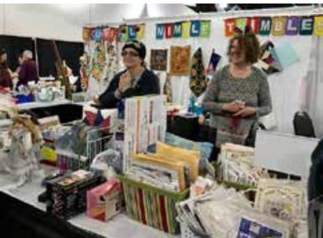
LNT Guild Boutique 2019

“In the crazy quilt of life, I’m glad you’re in my block of friends.”