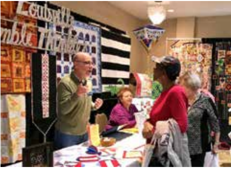
LNT Guild Booth 2019