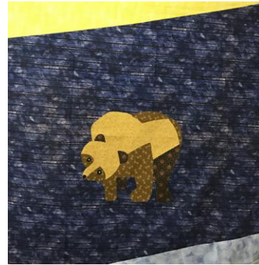
Brown Bear Appliqué